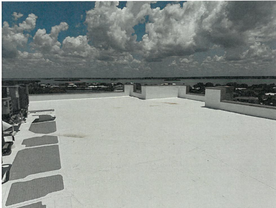
Section 1 of Wind Mitigation (Photo of Roof and Permit from 2024)

NOTICE: BEFORE EXCAVATING NOTIFY THE "CALL SUNSHINE" NOTIFICATION CENTER AT 1-800-432-4770